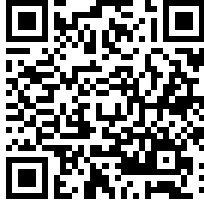
Online Notice Board