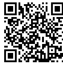
Request for Hearing